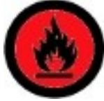
WHMIS: B2 Flammable Liquid

HMIS: Health H:2 Moderate Flammability F:3 Serious Reactivity R:1 Slight