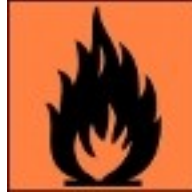
F: Highly Flammable

Risk Phrases: R-10 Flammable R-11 Highly Flammable R-36 Irritating to eyes, respiratory system and skin. R-50 Very toxic to aquatic organisms. R-61 May cause harm to the unborn child. R-62 Risk of impaired fertility. R-66 Repeated exposure may cause skin dryness and cracking. R-67 Vapors may cause drowsiness and dizziness.