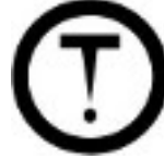
D2B Eye or Skin Irritant