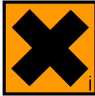
Xi: Irritant Xn: Harmful